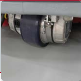
New polyurethane drive and rear tyres: outstanding traction either on dry or wet floors, non marking, high wear resistance

For large area commercial and industrial floor cleaning applications, there is simply no better choice.