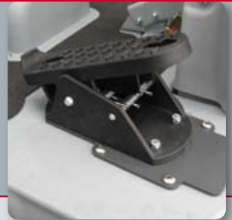
New robust glass filled nylon foot pedal and improved potentiometer