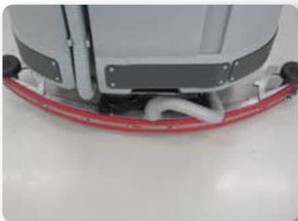
Complete new squeegee concept: perfectly adherent to the floor, extremely reactive on curves, easily adjustable ... for excellent drying results