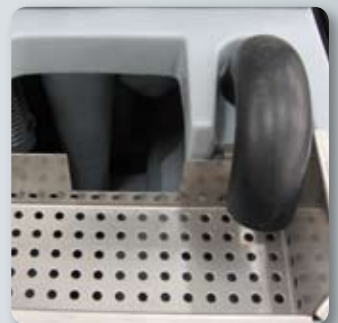
New recovery tank inlet system (180 degree recovery diverter + debris tray), for a quicker more efficient cleaning