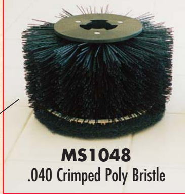
MS1048 .040 Crimped Poly Bristle

8.5 inches of heavy-duty bristles for full baseboard coverage