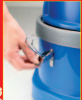
Long lasting metal clips secure motor/ filtration housing