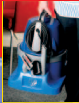
Convenient carry handle for hassle-free transporting