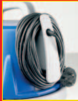
On-board cable store, easier and safer to use.