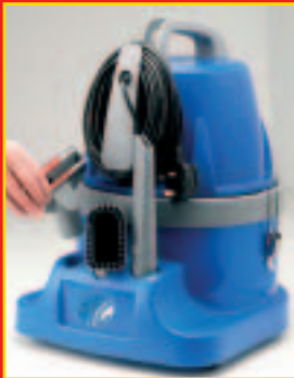
Fingertip access to all tools, stored and organised within the body