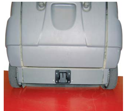
Parking brake for maximum safety