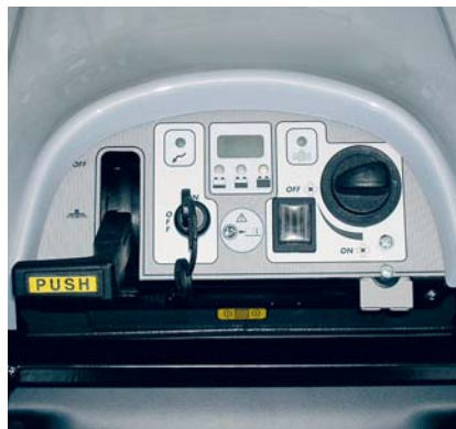
Easy to use control panel