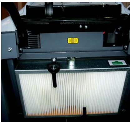
Electric filter shaker (optional)